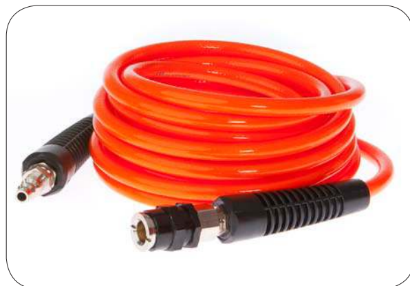
171301 PUMP UP EXTENSION KIT