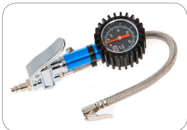
ARB605 TYRE INFLATOR GAUGE

ARB offers a range of accessories to help maximize the potential of your CKMTP12.