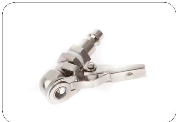
ARB607 TYRE INFLATOR COUPLING