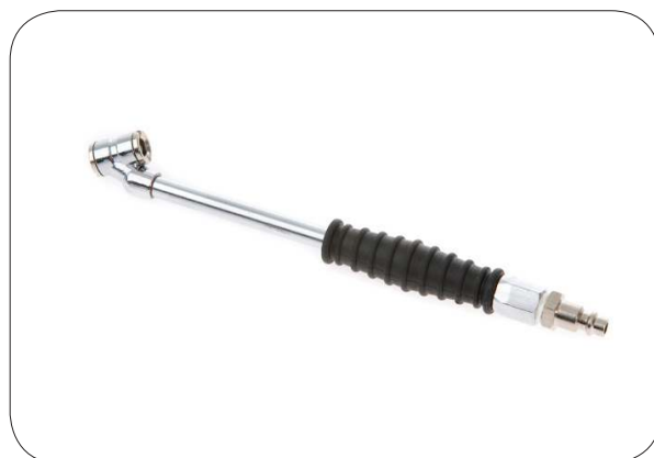
ARB06 TYRE INFLATOR WAND